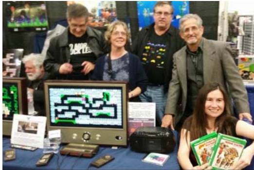
The Intellivision booth at the SoCal Retro Expo in January 2016.