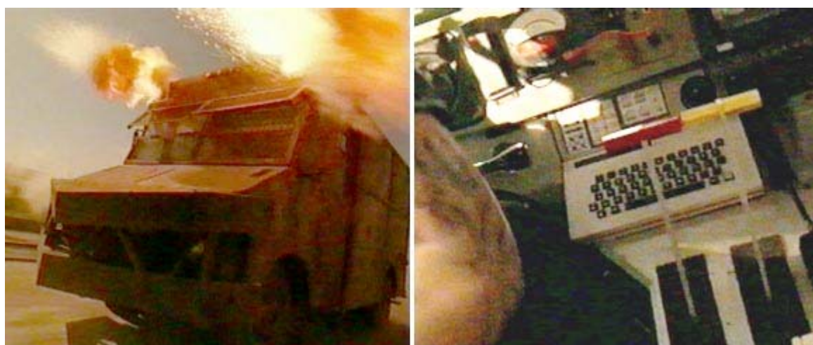
Barb Wire's rocket-launching van, powered by Intellivision!