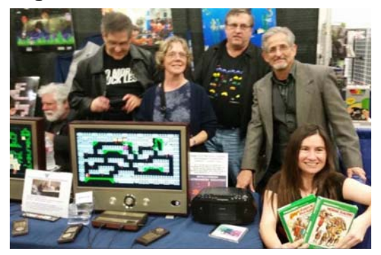
The Intellivision booth at the SoCal Retro Expo in January 2016.

The SoCal Retro Gaming Expo held in January of this year was such a success, they aren't waiting for a full year to go by before doing it again! This August 20 & 21, Saturday and Sunday, the Expo returns to Frank & Sons Expo Center in City of Industry near downtown Los Angles